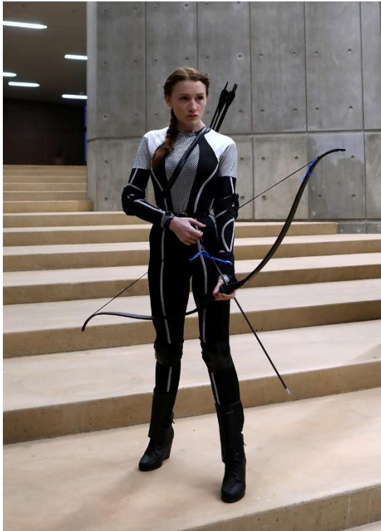
Hunger Games: Katniss Everdeen