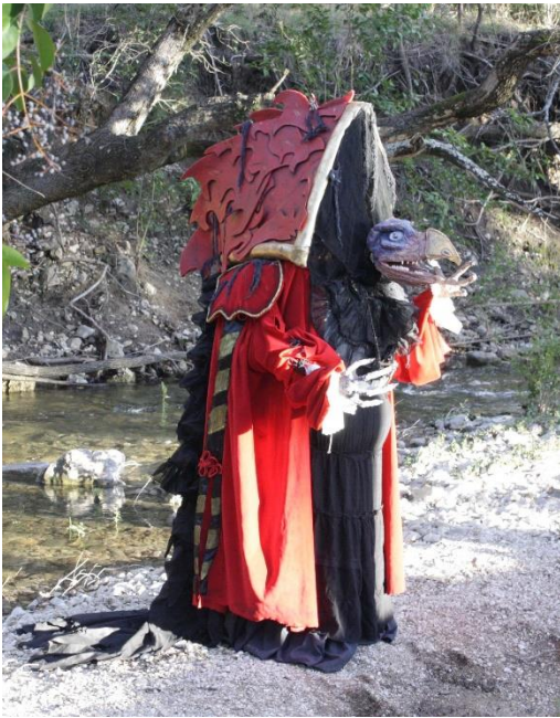
CHAMBERIAN SKEKSIS THE DARK CRYSTAL